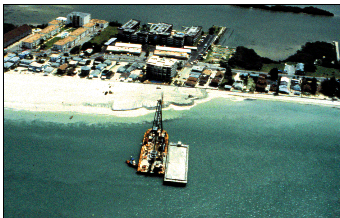
A recent beach nourishment project at Sand Key is an increasingly common counter-measure to beach erosion in highly developed coastal regions.

Under natural conditions, barrier islands shift in response to storms, sediment supply and changes in sea-level. Man-made structures such as sea walls, jetties, and even buildings and roads can alter the influence of these natural processes. Consequently, some areas have experienced rapid beach erosion, resulting in narrow beaches that are insufficient for recreational use or protection of upland properties. Beach erosion and loss of protective dunes has left the coast susceptible to damage from storms and hurricanes. A 1992 report issued by the Florida Department of Natural Resources designated 65% of west Florida beaches as "critical erosion areas". In response, several sections of the coast have undergone nourishment projects to restore beach widths to previous dimensions. This method of beach maintenance is expensive, typically costing well over a million dollars for each mile of beach, and needs to be repeated as often as every four years. While beach nourishment is becoming the most common means of addressing beach erosion, it may not provide a cost effective long-term solution, as sand resources for nourishment are limited along much of the west Florida coast.