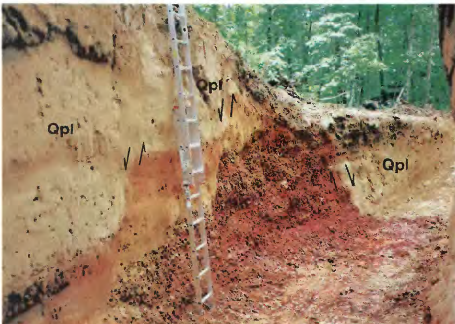
◀ Old quarry trench at the English Hill site in the Benton Hills, southeast Missouri. Qpl, Peoria Loess. Arrows indicate relative motion across faults.

Initial dating of faulted deposits indicates that a major episode of faulting in the Benton Hills occurred approximately 4,000–5,000 years ago. This episode had been preceded by multiple episodes and was followed by at least one other episode, all of undetermined ages. Other age constraints indicate that faulting in the Benton Hills has not been active in the past 1,540 years. Much additional work remains in order to better determine recurrence intervals, magnitude, and areal extent of earthquake-induced faulting in the midcontinent.