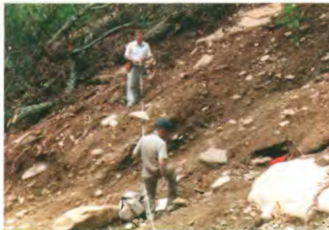
U.S. Geological Survey scientists measuring a fresh debris-flow scar near Graves Mill in Madison County, Virginia, after the storm of June 27, 1995.