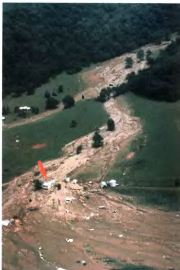
This debris flow near Graves Mill was triggered during the storm of June 27, 1995, in Madison County, Virginia. It emerged from a mountain channel (at upper right) and deposited rocky debris on this farm. At 11:30 am the powerful debris flow moved the two-story farmhouse (arrow) more than 30 feet from its foundation. The family in the house survived because they took refuge in the second story. Several other structures on the farm were destroyed.

Scientists from the U.S. Geological Survey and from cooperating universities, including Princeton University and the University of Virginia, have developed an inventory of landslides, debris flows, and flooding from the storm of June 27, 1995, by using aerial photography, field investigations, rainfall measurements from rain gages, and National Weather Service radar observations. This inventory and a debris-flow hazard map that was prepared from it will be used to help understand the conditions that can lead to disasters like the floods and debris flows caused by the 1995 summer storms in Virginia and to suggest methods of mitigating the effects of such events in the future.