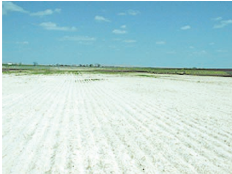
Figure 3. Photograph, taken in the spring, of a plowed field in the study area where salt minerals have formed on the soil surface.