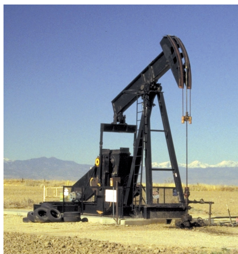
Figure 2. Photograph of an oil-well pump, one of many in the study area.

Because intense growth is occurring throughout the Front Range urban corridor, questions remain as to how urbanization will affect the future availability of oil and gas. USGS scientists on the Front Range Infrastructure Resources Project, using geologic and engineering data to model processes leading to oil and gas generation and accumulation, are focusing research