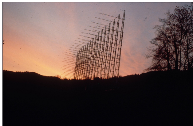
Figure 4. STARE receiver array at the new site in Norway.

Shortly after the system was put into operation, it became evident that the irregularity drift velocity was closely related to the ionospheric electron drift velocity, or electric field. The field of view of the STARE system covers the rocket trajectory of the typical rocket launch from Andenes. The system was put into operation on 17 January 1977, and on 23 January a rocket was launched with an electric field detector in the payload (Cahill et al., 1978). At this time the radar sta-