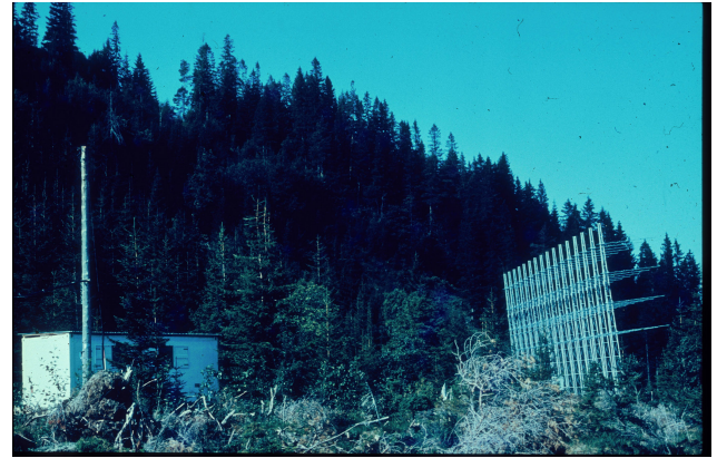
Figure 2. Receiving array (about 30 m length) and container with radar.