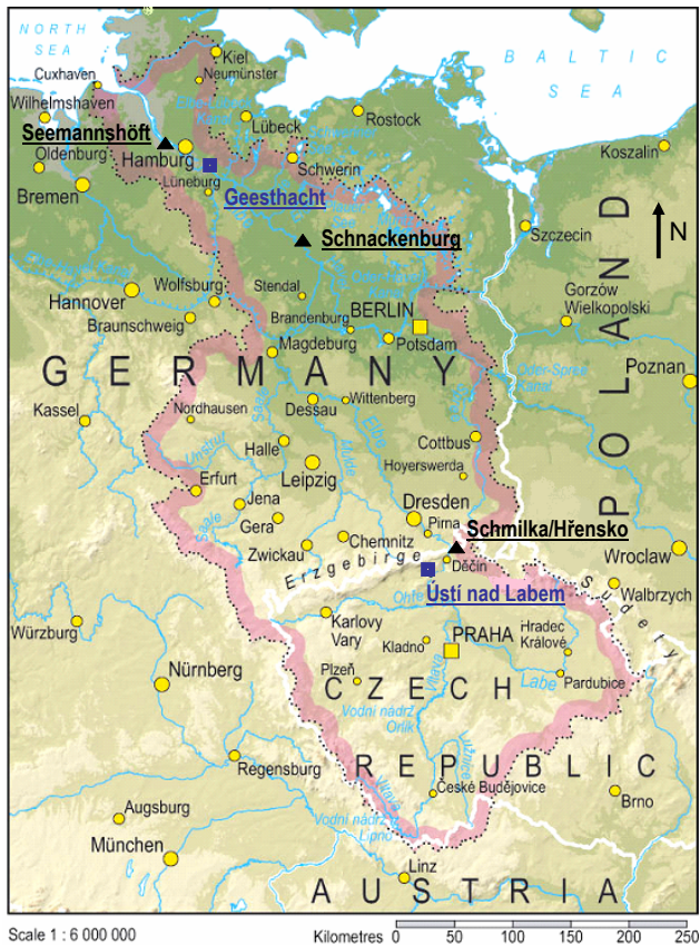
Fig. 2. Elbe River basin with main gauging stations (triangles) and fish passes (squares) (based on http://www.grid.unep.ch/product/publication/freshwater_europe/images/map9.jpg (24 April 2007)).

question of institutional design from two angles: from the point of view of regime effectiveness, and through a direct evaluation of the institutional design.