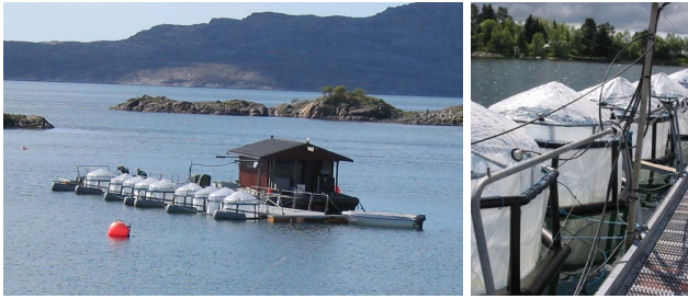
Fig. 1. PeECE III experimental set-up at Large-Scale Mesocosm Facility of the University of Bergen in Espesgrend, Norway. Left: array of 9 mesocosms in front of the floating raft. Right: Mesocosm enclosures were covered by gas-tight tents made of ETFE (ethylene tetrafluoroethylene) foil, which allowed for 95% light transmission of the complete spectrum of sunlight, including UVA and UVB.

seawater acidification on plankton communities were also addressed in a series of 3 mesocosm experiments, called the Pelagic Ecosystem CO 2 Enrichment (PeECE I-III) studies, which were conducted in the Large-Scale Mesocosm Facilities of the University of Bergen, Norway in 2001, 2003 and 2005, respectively (Fig. 1). Each experiment consisted of 9 mesocosms, in which CO 2 was manipulated to initial concentrations of 190, 350 and 750 \mu\text{atm} in 2001 and 2003, and 350, 700 and 1050 \mu\text{atm} in 2005 (Fig. 2; for further details see Engel et al., 2005; Grossart et al., 2006; Schulz et al., 2008). Results of the first two experiments are summarized in papers by Rochelle-Newall et al. (2004); Engel et al. (2004, 2005); Delille et al. (2005); Grossart et al. (2006); Benthien et al. (2007). This volume of Biogeosciences reports mainly on the results of the PeECE III experiment which was conducted between 15 May and 9 June 2005 and involved over 50 scientists from 14 European and North American institutions of which more than 30 scientists worked on site at the Espesgrend Marine Biological Station (Fig. 3).