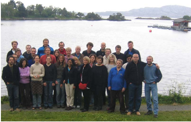
Fig. 3. On site participants of PeECE III study at the Espesgrend Marine Biological Station: