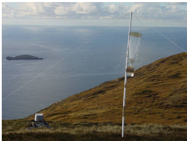
Fig. 1. Cloud collector set up on Caepabhal. Collector was erected onto the end of a 2 m pole and secured with guy ropes.

residents, having adapted to exploit this diffuse but vast environmental niche. That is, are they scavenging nutrients from cloud water and using wind and rain for dispersal? In particular, the role of some species of bacteria with heterogeneous ice nucleation ability may be highly significant in raindrop formation (Morris et al.; 2005 and Vali, 1996).