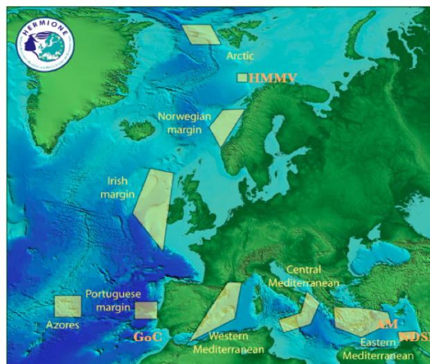
Fig. 1. Map of the European marginal seas. HMMV: Håkon Mosby mud volcano, GoC: Gulf of Cádiz, AM: Anaximander Mountains, NDSF: Nile deep-sea fan.

Following one of the key objectives of HERMIONE, i.e. the distribution and interconnection of deep-sea ecosystems, in this paper we exploit the available data on prokaryotic occurrence in the sediments of the HMMV, Gulf of Cadiz and eastern Mediterranean MV/pockmarks (Fig. 1) and explore whether these systems are characterized by high (interconnectivity) or low (isolation) degree of shared bacterial and archaeal species. Such comparisons among distant ecosystems but with similar dominant microbial processes can provide meaningful information about the spatial and temporal scales of variability. Towards this, we investigated the occurrence of published 16S rRNA gene sequences in these habitats. In particular we aimed at elucidating the shared bacterial and archaeal phylotypes between the three sites, as it is hypothesized that such species are best candidates for having a predominant role in ecosystem functioning (Konopka, 2009).