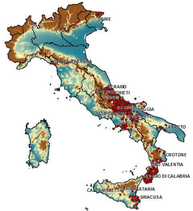
Fig. 3. Italian municipalities struck by floods in 2003.

On the other side, soil effects and damages severity is connected to factors like land use, processes dynamics and to the eventual presence, efficiency and functionality of protection works. Of course it is clear that generally a wider territorial distribution of settlements causes worse damages under the