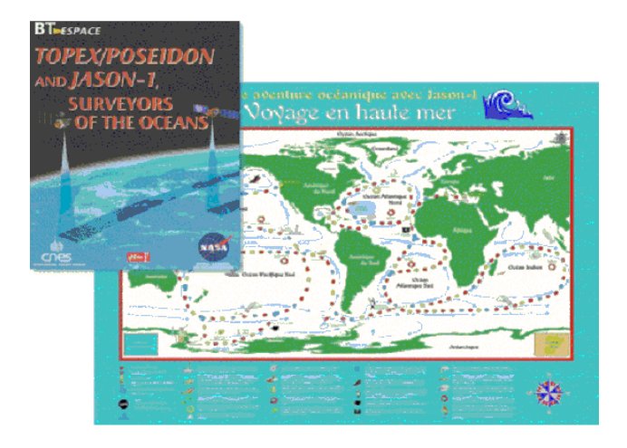
Fig. 3. A French book for children translated into English, and a JPL board game translated into French... cooperation in Education is going both ways across the Atlantic.

CNES developed an educational project, named "Argonautica", that proposes an innovative working environment and new ways of using satellite data [Canceill et al, 2003]. It provides a framework for science teaching in schools based on the theme of oceanography, climate, and tracking of an-