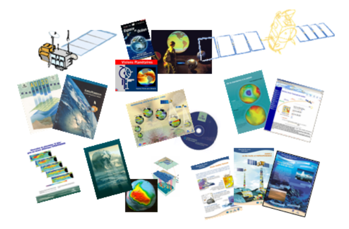
Fig. 2. A potpourri of AVISO outreach realization or participation between 1992 and 2002.

Several series of fact sheets have been published throughout the mission. The project web site, rolled out in 1995, has progressively added new features for users, including an online product catalog, as well as information for the wider audience interested in Earth sciences and oceanography. It is now the major medium for outreach, continuously updated, with news, new information and updated features.