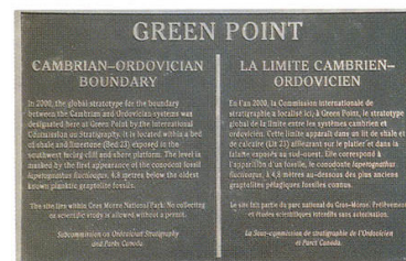
The plaque describing the base of the Ordovician at Green Point, Newfoundland, Canada.

Beach) who is Chairman of the Subcommittee on Ordovician Stratigraphy. He highlighted the significance of world stratotypes and the process by which Green Point was selected. He acknowledged the tremendous intellectual efforts of the scientists involved in the work. Finally, he noted that "Geology is a very human science and selection of this stratotype at Green Point represents the culmination of a human process, and so it is a great pleasure to dedicate this plaque today".