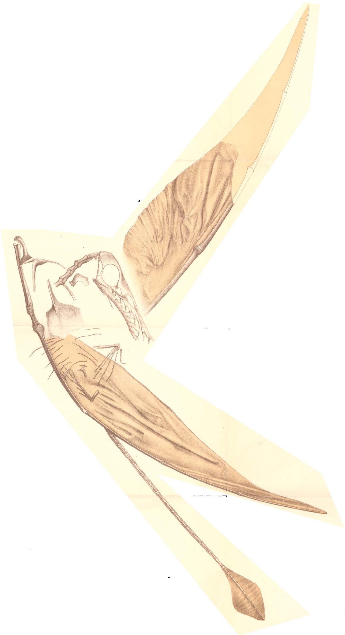
RHAMPHORHYNCHUS PHYLLURUS , Marsh. ♀.