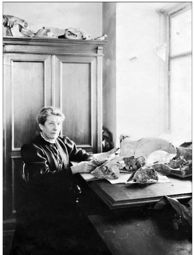
Text-Fig. 2. Maria PAVLOVA (1910) in the Geological Cabinet (museum) of the Imperial Moscow University.

“Due to my speciality – palaeontology – I had to go quite often for thousand versts (1 versta – 1066,8 meters – Z.B.) from Moscow to a museum, when I learned that it has an object – fossils of any scientifically interesting animal. And