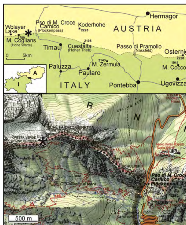
Figure 1. Location map of the Grüne Schneid section.

Beside conodonts, ammonoids (24 taxa; Korn in Schönlaub et al. 1992) and trilobites (22 taxa; Feist in Schönlaub et al. 1992) are abundant; in the thin sections ostracodes, gastropods, cephalopods, trilobites, crinoids, brachiopods and bivalves can be observed.