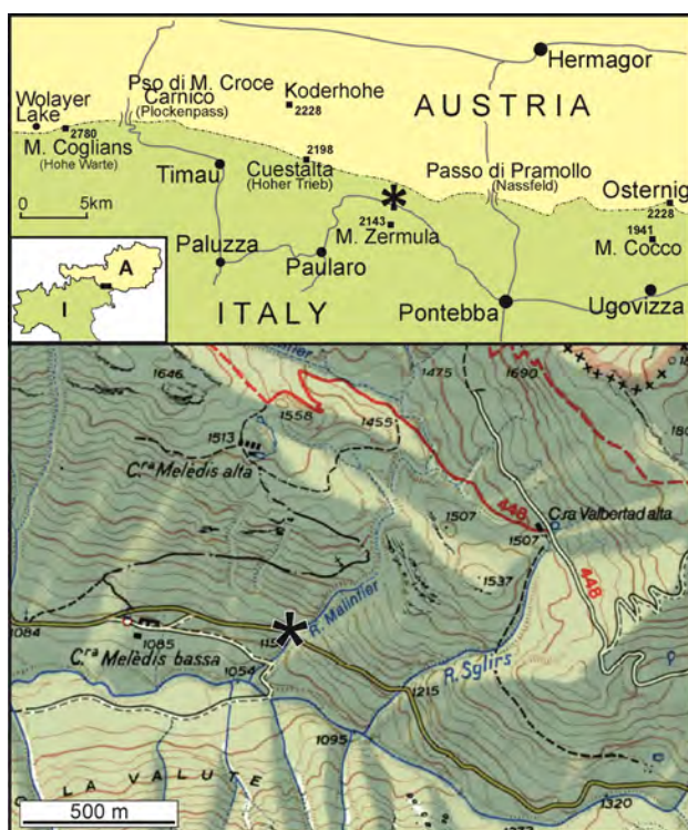
Figure 1. Location map of the Rio Malinlier section.

The Rio Malinlier section can be reached from Passo del Cason di Lanza moving for about 4 km along the road to Paularo. The section is located just west of the bridge on Rio Malinlier waterfall, at altitude 1159 m (Fig. 1).