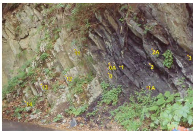
Figure 2. View of the Rio Malinlier section showing the location of the conodont samples.

Twelve conodont samples have been collected from the Rio Malinlier section (Fig. 3). The abundance is always very low, except sample RM 2, and five samples resulted barren of conodonts. In general, the state of preservation is poor, being part of the fauna represented by indeterminable fragments.