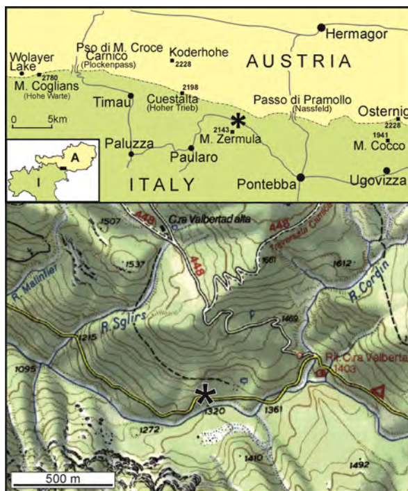
Figure 1. Location map of the Valbertad section.

The Valbertad section can be reached from Passo del Cason di Lanza moving for about 3 km along the road to Paularo. It is located north of the road at altitude 1325 m a few hundred meters west of the place where stood the old Casera Valbertad Bassa (Fig. 1).