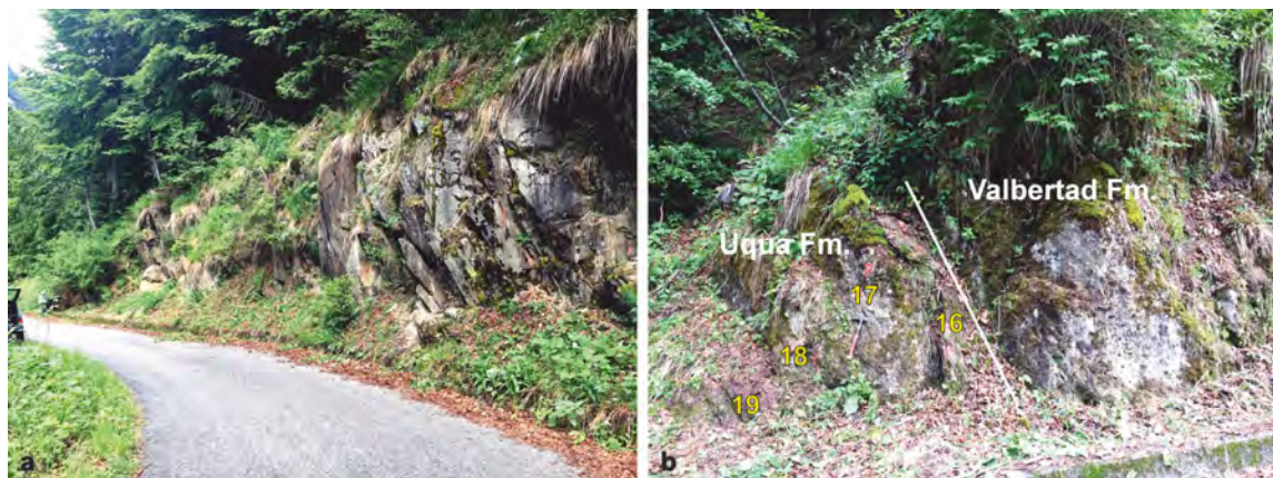
Figure 2. Views of the Valbertad section. A. Panoramic view from the base of the section. B. Detail of the upper part.