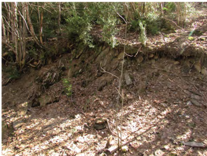
Figure 1. Partial view of the Rinero 2 section; basal and middle graptolite shales with carbonates in between.

The locality (Fig. 1) is accessible from the regional road A-139 Benasque-Francia. On the right side of the San Chaime Bridge a forest track coinciding with GR-11 crosses the Rinero stream. After crossing the creek, turn right upstream and cross again southwards the creek, which left bank meets the north end of the forest trail between the Rinero and Robiella brooks. The section starts a few meters to the south along the forest track.