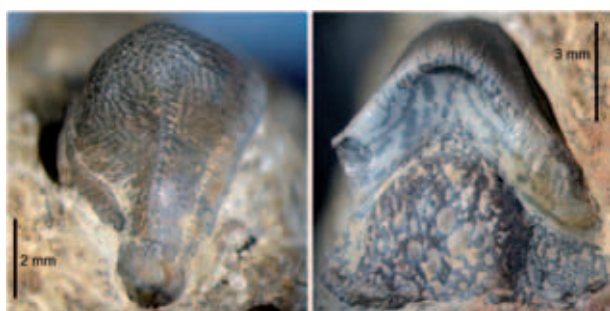
Fig. 1: The two Acrodus sp. teeth found at the base of the Richthofen Riff, near the Sieff camp (BZ). Acrodus represent a new taxon for the San Cassiano association.

The specimens are two domed, finely ornamented tooth crowns. Teeth are strongly arched in labial and lingual views. At least one lateral cusplet was clearly present although only half is preserved. A single, well marked longitudinal ridge runs across the crown. The crown is projected lingually. The ornamentation is finely reticulate. Crown is separated from the root by a band of vertical ridges. No expanded lingual torus is