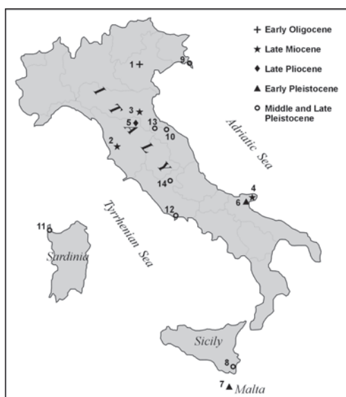
Fig.1: Map of main fossiliferous localities of Italy and Malta. 1- Monteviale (Veneto); 2- Baccinello V0 (Tuscany); 3- Brisighella (Romagna); 4- Gargano (Apulia); 5- Montagnola Senese (Tuscany); 6- Pirro Nord (Apulia); 7- Ghar Dalam Cave (Malta); 8- Spinagallo Cave (Sicily); 9- Slivia (Venezia Giulia); 10- Vento Cave (Marche); 11- Punta Padre Bellu (Sardinia); 12- Breuil Cave (Latium); 13- Monte Cucco Cave (Marche); 14- Cittareale Cave (Latium).

(Meschinelli, 1903; Kotsakis et al., 1997) (Figs. 1, 2). It is a large chiropteran classified in its own subfamily, Archaeopteropodinae, and considered by some authors (Russel & Sigé, 1970) to belong to the suborder Microchiroptera and by others (Smith & Storch, 1981) to the suborder Megachiroptera. Unfortunately the original sample has been lost during the Second World War and only some rather good casts are available. Archaeopteropus was part of an assemblage that, if considered as a whole, shows a tropical character.