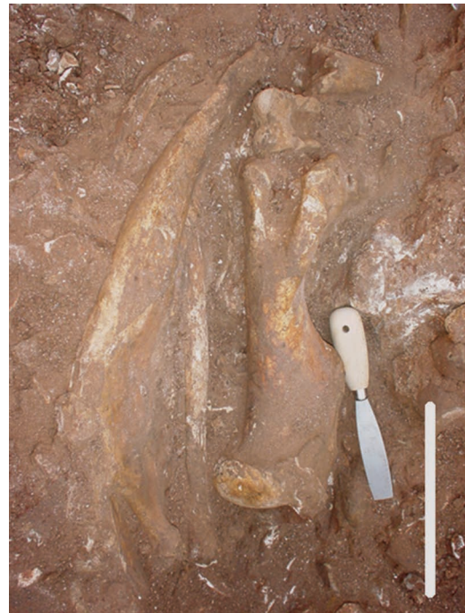
Fig. 2: Fossil bones of layer 7 (scale bar: 20 cm).

Cervids are represented by some isolated teeth and limb bones (layers 2–8); two large-sized first phalanxes recorded in level 7 can probably be ascribed to Megaloceros giganteus . Among carnivores, the occurrence of the wolf and the red fox is testified by some isolated teeth, occurring from layers 2 to 8, the lynx and the cave lion are recorded from layer 8 (some teeth and a talus respectively).