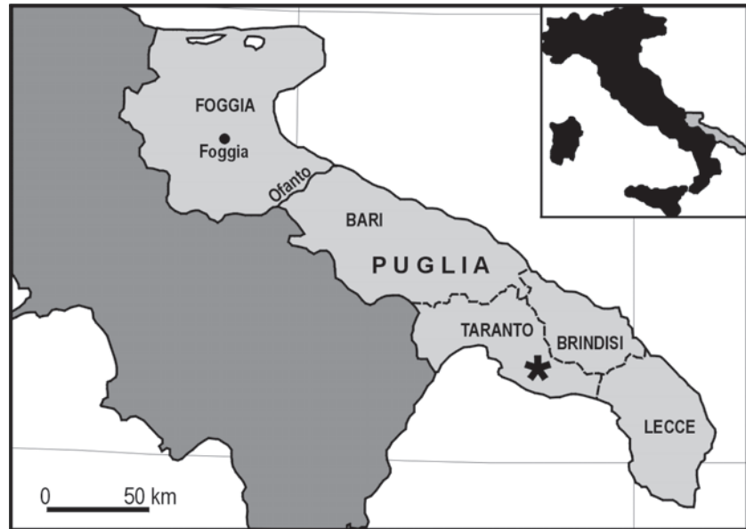
Fig. 1: Location of Avetrana

In the present paper we present a preliminary analysis of the collected material and some general outlines of the fossiliferous karst deposit.