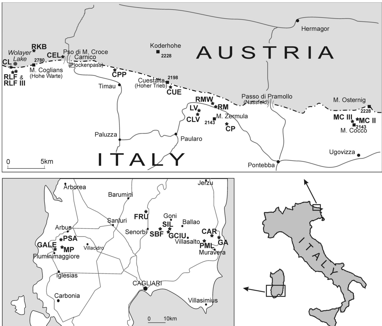
Figure 3. Location map of the studied sections. Locality abbreviations: Carnic Alps : CEL – Cellon; CL – Costone Lambertenghi; CLV – Casera La Valute; CP – Cima Pizzul; CPP – Casera Pal Piccolo; CUE – Cuestalta; LV – La Valute Cave; MC II – Monte Cocco II; MC III – Monte Cocco III; RKB – Rauchkofel Boden; RLF – Rifugio Lambertenghi Fontana; RLF III – Rifugio Lambertenghi Fontana III; RM – Rio Malinfier; RMW – Rio Malinfier West. Sardinia : CAR – Punta Carroga; FRU – Monte Fruccas; GA – Genna Arrela; GALE – Galemму II; GCIU – Genna Ciuerciu; MP – Ma-son Porcus; PML – Ponte Monte Lora; PSA – Perda S’ Altari; SBF – San Basilio Fenugu; SIL – Silius.

Lambertenghi Fontana and Rifugio Lambertenghi Fontana III sections (Corradini & Corrigan 2010) and the Costone Lambertenghi section (partly equivalent to the Seekopf Sockel section by Schönlaub 1980). From a facies similar to the Plöcken we studied the Monte Cocco II section (Corrigan & Corradini 2009), in the eastern part of the Carnic Alps. From the Findenig facies the Rio Malinfier, Rio Malinfier West (Corrigan 2011) and the La Valute section (Corrigan et al. 2011). Furthermore, the first author had the chance to study the collections from the Silurian part of the Cellon Section (Walliser 1964) and from the Rauchkofel Boden (Schönlaub 1980) and other sections deposited at Göttingen University and in the