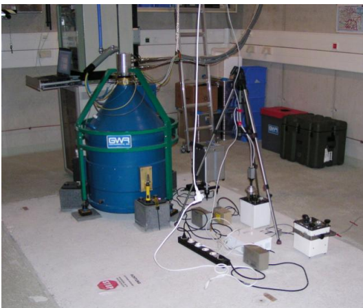
Figure 1: GWR-025, Scintrex CG-5, LCR-G 949 and LCR-G 220 at the Conrad Observatory.

A special problem was that - contrarily to the SG25 and CG5 - the two LCR-G meters were not equipped with feedback systems. The LCR-G949 was registering by using a CCD ocular while LCR-G220 uses the CPI output voltage. The transfer functions of LCR-G gravimeters are expected to be non-linear and dependent on the beam position. After data pre-processing (e.g. spike and step elimination) a standard tidal analysis was computed by using the ETERNA software package (Wenzel 1996) to determine the instrumental response in the frequency domain. Then a comparison and adjustment with the SG data was carried out to achieve the proper scale factors in the time domain.