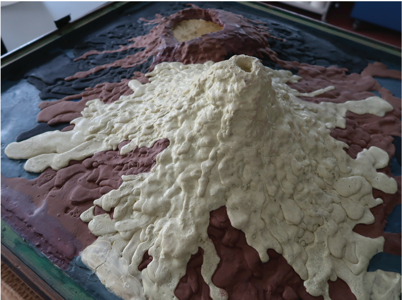
Figure 4. Model of a volcano made of sulphur by Hochstetter in cooperation with Müller and Opl at his brother's soda factory.

conspicuous heading to distinguish the Colony, and a concise description of the object, with the name of the exhibitor, in English, German and French (The Vienna Exhibition 1873: 11).