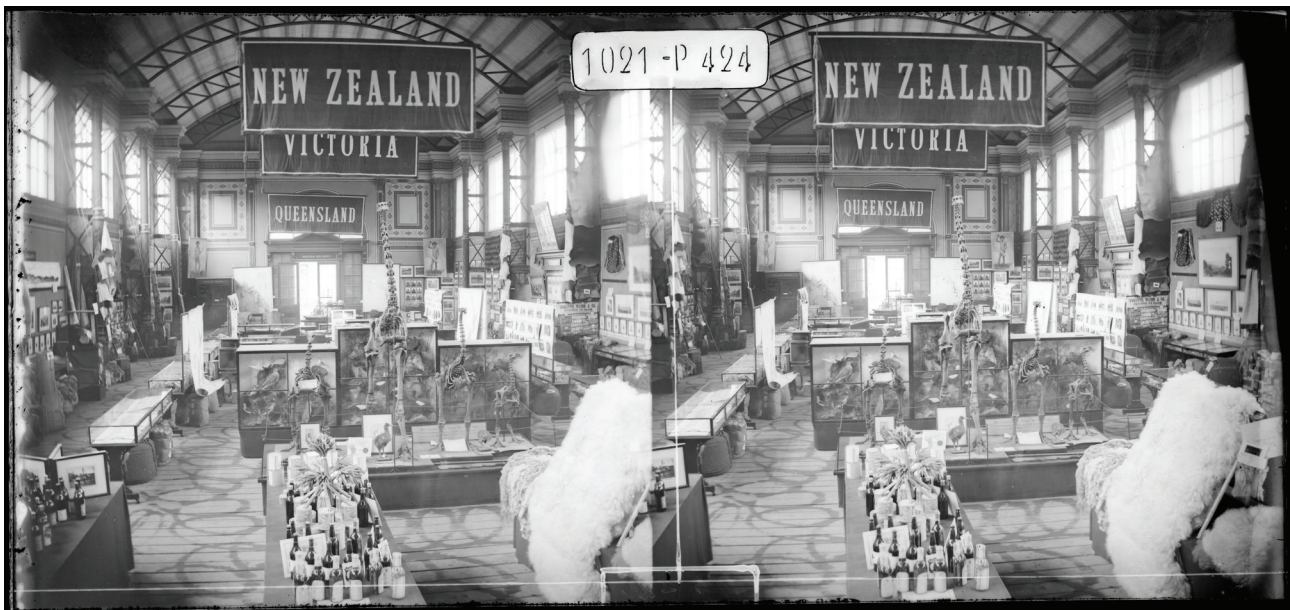
Figure 3. The New Zealand Court at the World Exhibition in Vienna 1873, “Photographen Assoziation”. Österreichische Nationalbibliothek/Austrian National Library

this presentation by Hochstetter and, in the context of volcanoes, he also referred to Haast’s moa skeletons, which he praised as also being particularly suitable phenomena for representing changes in the earth’s surface.