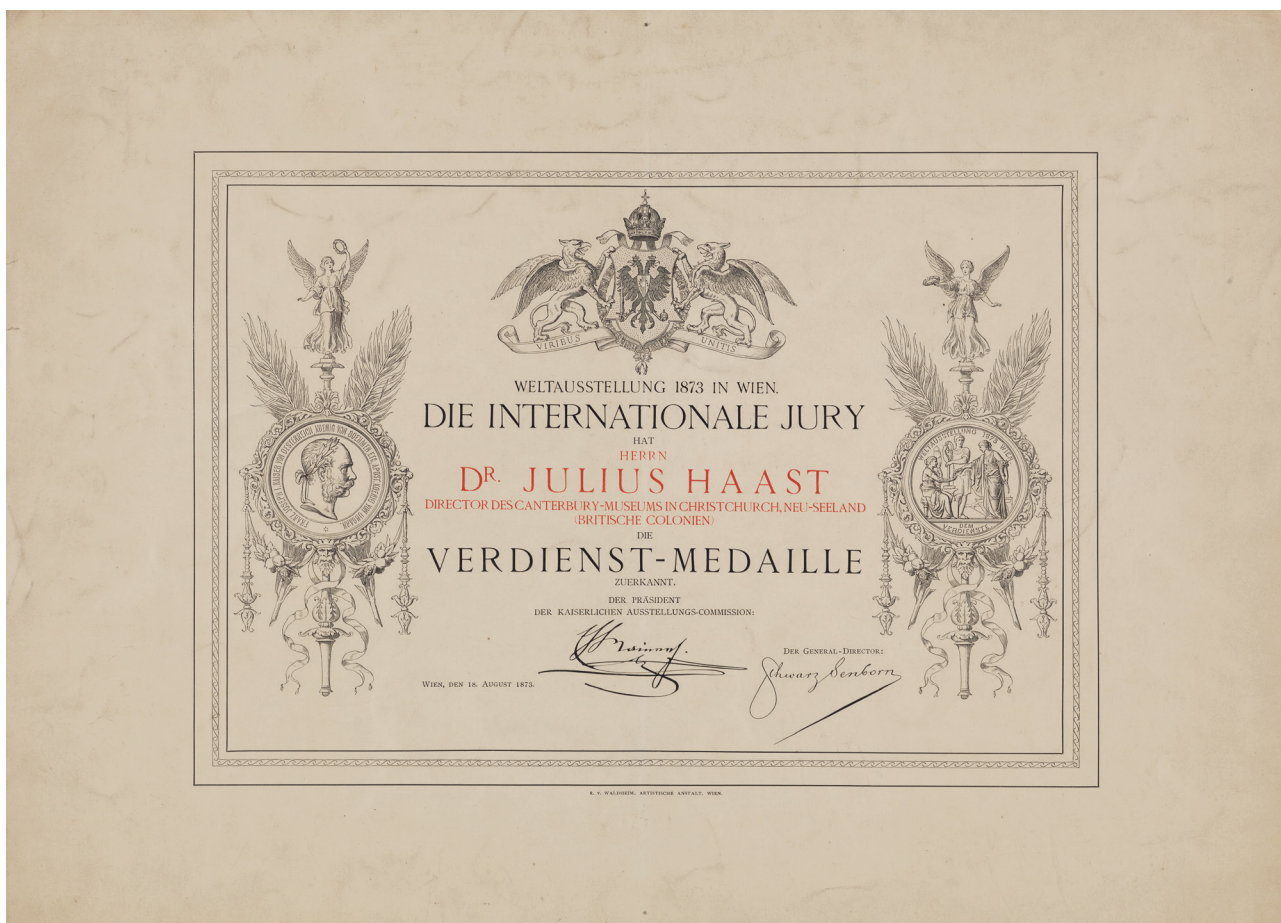
Figure 1. Certificate from the Viennese International Exhibition of 1873 for Julius von Haast. Dated Vienna, 18 August 1873, signed by Archduke Rainer Ferdinand of Austria and Wilhelm von Schwarz-Senborn. Printed by Rudolf von Waldheim, Vienna; letterpress in red and black, with signatures in black ink, on paper, 423 x 592 mm. MSO-Papers-0171-17, Alexander Turnbull Library

This discourse about the extinction of birds was introduced to the Austrian public by Hochstetter's well known and greatly admired book about New Zealand (Hochstetter 1863: 458). The English presentation in the catalogue for the Vienna World Exhibition particularly promoted migration, but this aspect did not go down well in the Viennese press. Rather, there was a warning against it, and the portrayal of the pleasant climate in New Zealand was ridiculed for this reason: "But the British government uses the exhibition to give very extensive information about the conditions in New Zealand ... and hopes to increase the population of that Australian island" ([Anonymous d], 27 June 1873: 9).