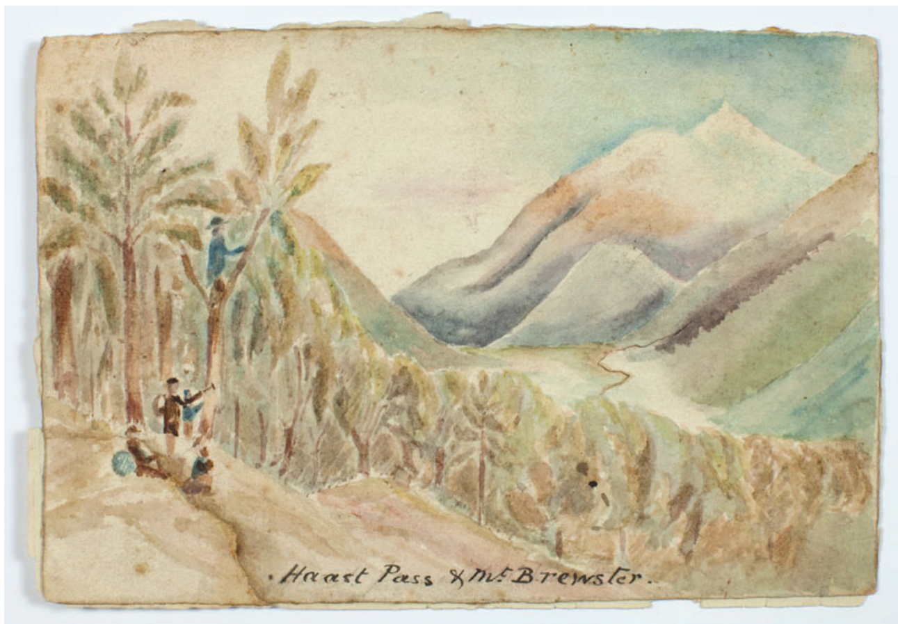
Figure 11. A sketch by William Young of Haast and party's first view of Tioripātea. Canterbury Museum 1984.224.1