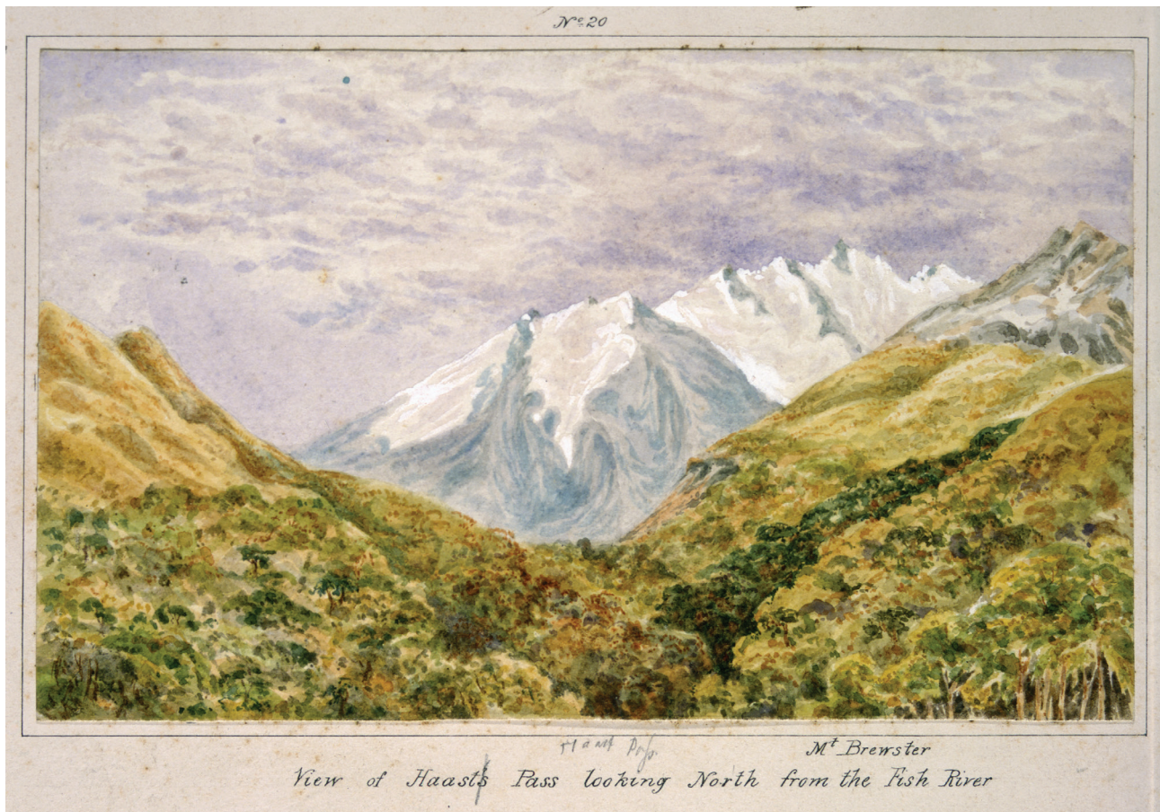
Figure 10. Haast's painting of the view from Fish River. Alexander Turnbull Library A-149-011