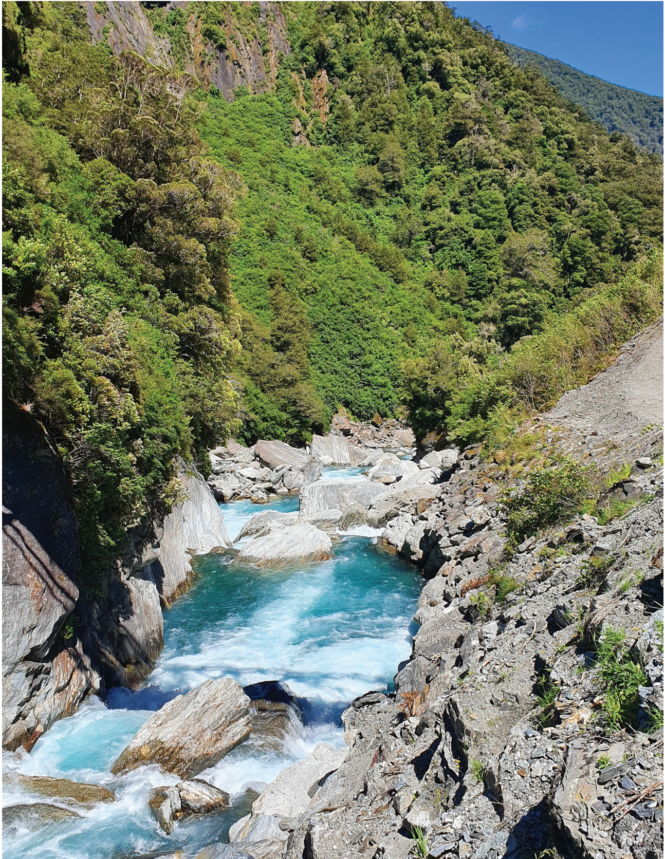
Figure 12. The rugged country near the Gates of Haast in good weather. Haast's party travelled down the left side of the river.

After crossing the River Clarke (now Landsborough River) the party was committed to staying on the north side of the Awarua as the main river was now too large to cross again. The route Haast's party took can be seen in Figure 13.