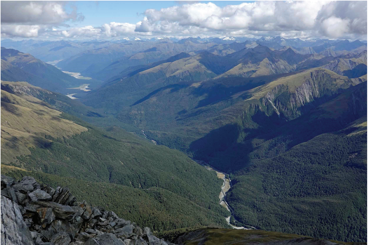
Figure 1. Tioripātea, the remarkably low pass through the Southern Alps. The pass is in the middle of the photograph with Makarora Valley flats visible in the distance.