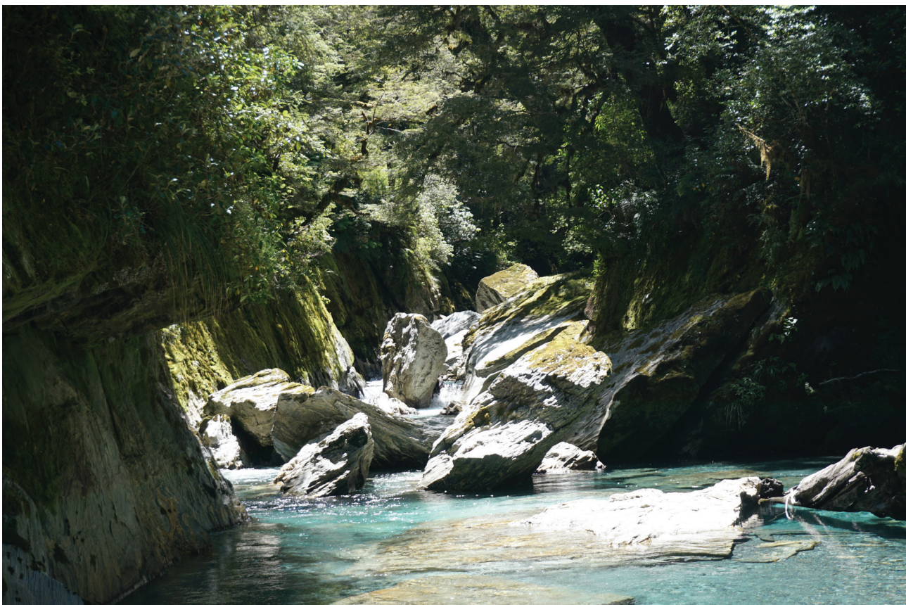
Figure 9. Gorge in the Upper Makarora River on the way to Tioripātea.