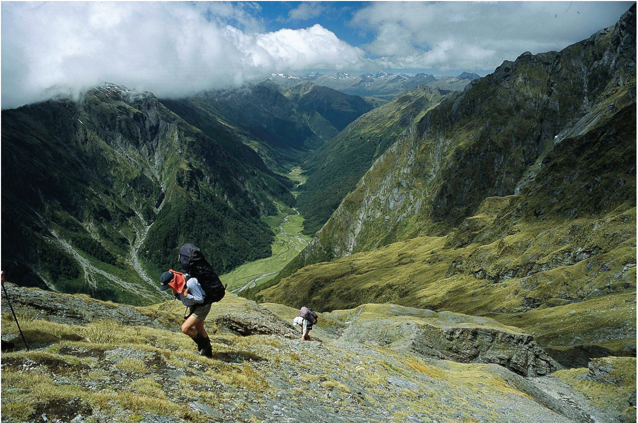
Figure 7. Looking down the Blue Valley from Haunted Spur, west of Māori Saddle. Cloud is gathering over the Main Divide on the left.

After travelling with his nephew to the junction of the Hāwea and Clutha Rivers in early January 1863, Cameron struck out alone with minimal equipment, a horse, a dog called Lassie and a gun ( Otago Daily Times , 26 February 1910: 3).