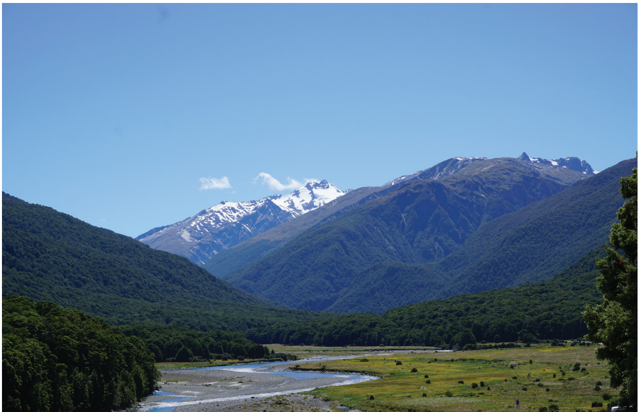
Figure 6. A view towards Tioripātea from Cameron's Flat. Mt Brewster is the snow-covered mountain in the background.

Cameron's account of his journey, written at Upper Clutha on 11 February (when Haast and party were still battling down the Haast River) has recently been located on the National Library of New Zealand's website Papers Past in a collection of his letters published in the New Zealander , 19 March 1864: 6. This provides some details of where he went but is lacking in specifics partly due to the difficulty of describing locations in unmapped territory.