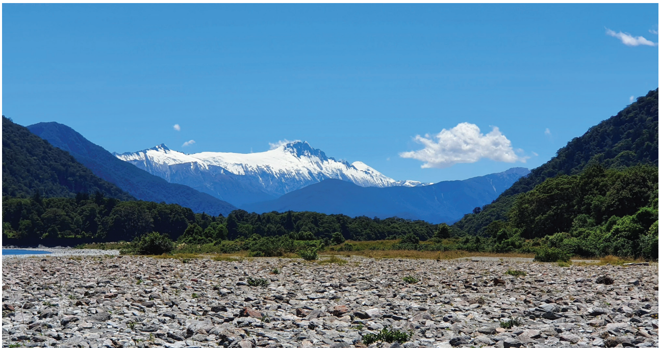
Figure 16. The mountain previously known as Rakai (which means to stand up threateningly) but now known as Mt Hooker, from the junction of the Burke and Awarua or Haast Rivers.