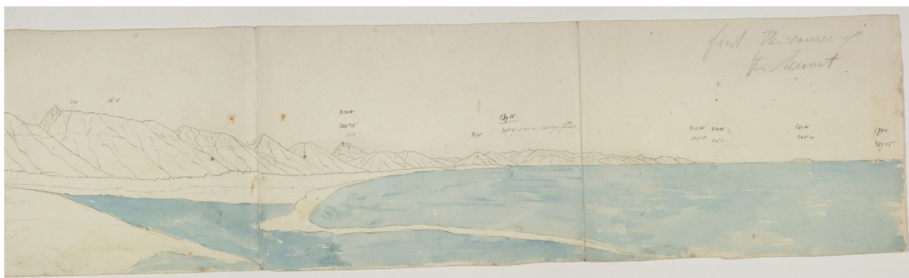
Figure 15. Section of a panorama by Haast showing details of the Awarua or Haast River mouth, looking south. Alexander Turnbull Library C-097-085

While Cameron and Haast had been travelling beyond the head of Lake Wānaka, others had also been searching for a pass to the West Coast. On 16 February 1863, Samuel Symms and William Sutcliffe reported that they had found a pass west of the Shotover River ( Otago Daily Times , 16 February 1863: 5). Cameron's journey was reported shortly afterwards prompting Symms to write a letter saying that their pass was in Otago and much more useful than Cameron's Canterbury pass ( Otago Daily Times , 18 February 1863: 5).