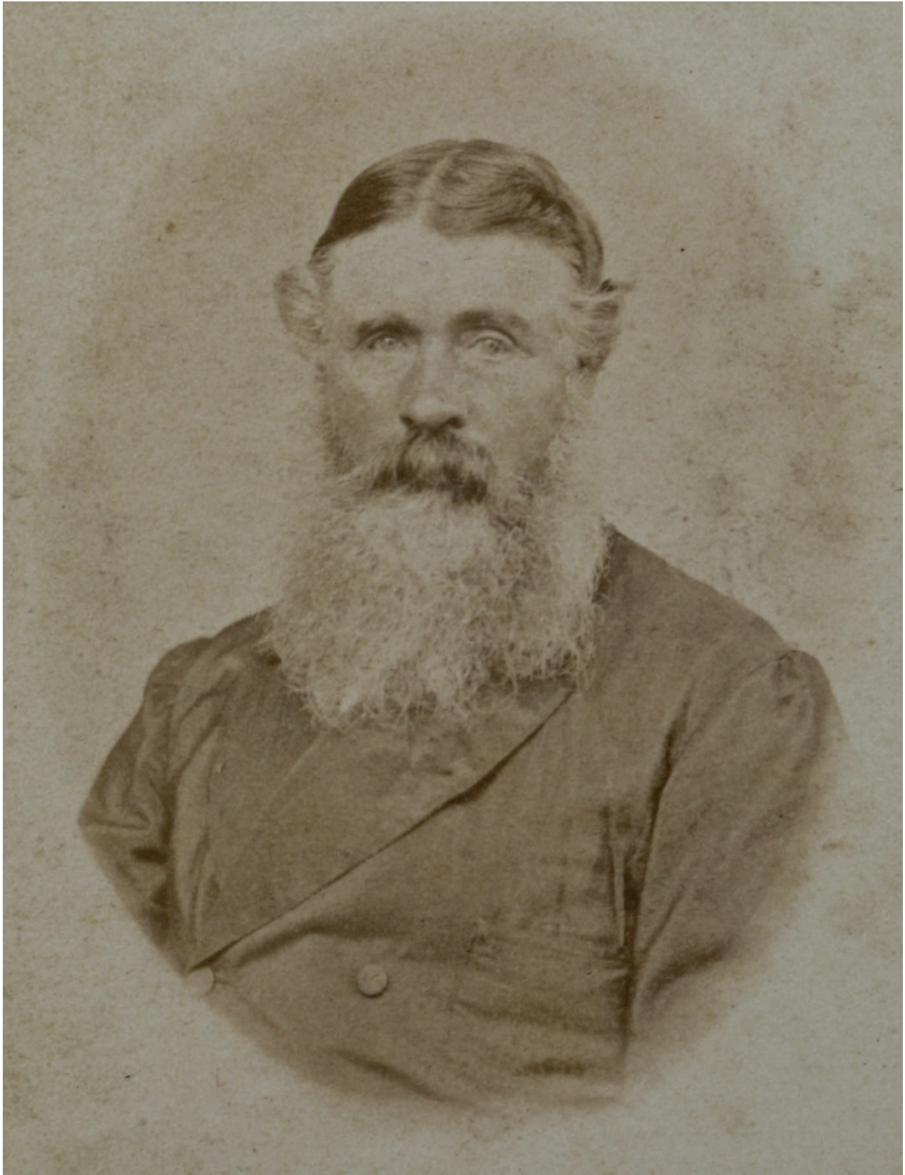
Figure 5. Charles Cameron (1820–1909). Sourced from blenheim175.files.wordpress.com/2015/03/charles-cameron.jpg [accessed 9 November 2021]. Published online with a Creative Commons Attribution-Non Commercial-Share Alike 4.0 International Licence

the Alps [travelling] from Lake Wanaka to the mouth of the Awarua” (Haast to Hooker, 13 September 1862 in Nolden et al. 2013: 27).