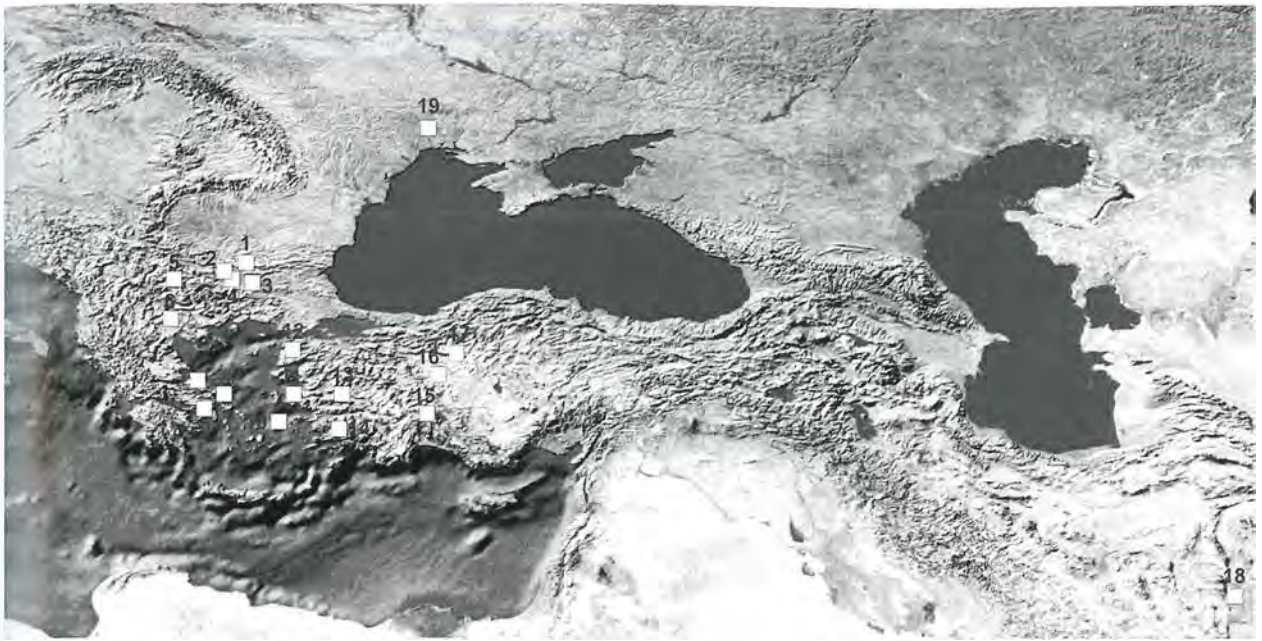
Figure 1: Late Miocene localities with Ancylotherium pentelicum (GAUDRY & LARTET, 1856) in the Eastern Mediterranean and adjacent regions. 1. Strumyani; 2. Gorna Sushitsa; 3. Hadjidimovo; 4. Kalimantsi; 5. Veles; 6. Pentalophos; 7. Kerassia; 8. Halmyropotamos; 9. Pikermi; 10. Samos; 11. Karaburun; 12. Gülpınar; 13. Kemiklitepe; 14. Salihpasalar; 15. Konya-Kızıllören; 16. Pinaryaka; 17. Alkaşdağı; 18. Maragheh; 19. Novoukrainka.

and time of divergence of the Chalicotheriinae from the Schizotheriinae cannot be precisely determined (COOMBS, 1989). In the present discussion, we will focus on the Eastern Mediterranean schizotheriine record and lay particular emphasis on its well-documented late Miocene representative Ancylotherium pentelicum . We will also briefly discuss the Eastern Mediterranean chalicotheriine record, as its synchronic and sometimes sympatric occurrence may offer significant palaeoecological and biogeographical implications (THENIUS, 1953; ZAPFE, 1979; COOMBS, 1989; GERAADS et al., 2001; SCHULZ et al., 2007).