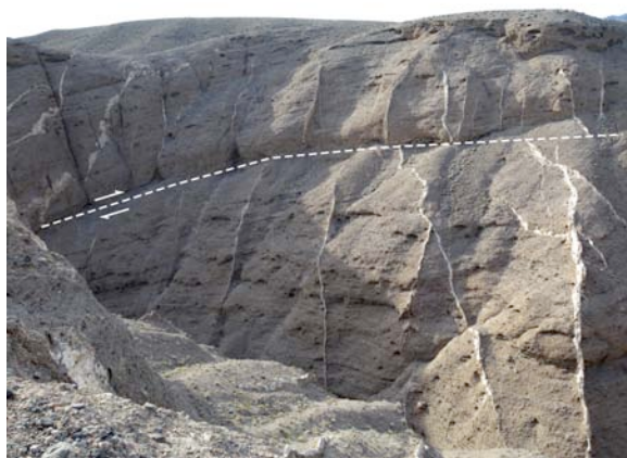
Fig. 1. Calcite veins in fanglomerate of the Pliocene Funeral Formation in Furnace Creek wash, Death Valley, California, USA, offset by a low-angle fault.

First results from the southern Great Basin were reported by Winograd et al. (1985), who determined \delta D values of inclusion water in Plio-Pleistocene calcite veins (fossil spring feeders) emplaced in clastic deposits of the Amargosa Desert and Furnace Creek (Death Valley), Late Pleistocene phreatic deposits from Devils Hole cave in Ash Meadows, and Holocene flowstone from Trout Springs cave in the Spring Mountains. The authors reported a unidirectional decline of \delta D from values between -50 and -70 ‰ to values ranging from -85 to -105 ‰ between the