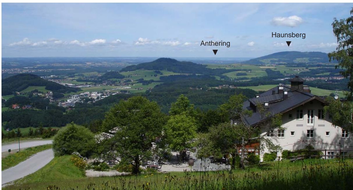
Figure A1.1 ▲ View from Heuberg to north