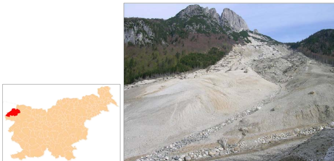
Fig. 2: Left – municipality Bovec, where landslide Stože is located. Right – slope, where landslide Stože was "triggered".

A part of the slope debris above the landslide (approx. 1 million m 3 ) remained in place, but its stability was reduced to the limit state of equilibrium and continues to pose a threat. That is why we want to apply new techniques and to evaluate and compare the results with already performed researches: geological, engineering geology and hydrogeology mapping, drilling (piezometers, inclinometers – which were destroyed later), ground seismometry and ground radar. Our work will comprehend (1) microtremor measurements (TROMINO portable seismographs for microtremor monitoring on landslides with HVSR – Horizontal to Vertical Spectral Ratio) to determine the depth of landslide thickness and landslide activity stage in time of measurement) and (2) airborne geophysical mapping (will be performed by GSA) to help detect areas susceptible to a high sliding risk.