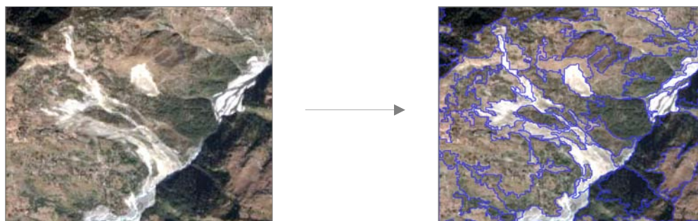
Fig. 2: The success of OOA relies heavily on proper delineation of the features of interest, hence on appropriate segmentation. Only then it is possible to make use of contextual parameters, such as length/width ratios of slides, or adjacency to specific source areas that supports landslide type determination.

Using OOA efficiently also raises several problems. The actual analysis is reliant on proper image segmentation (Figure 2), the subjectivity and trial-and-error nature which has been the subject of years of research. Hence, research now focuses on how image statistics and intelligent object merging, rather than visual fine-tuning, can be used for an objective segmentation. Further work is also needed to develop OOA-based methods that include the mapping of other parameters needed in risk assessment, such as elements at risk. Segmentation-based analysis can also be applied to other data types often collected in landslide areas, such as laser scanning or airborne geophysical data, or to track changing features in slow-moving landslides. In the context of the SAFELAND project those, too, are explored.