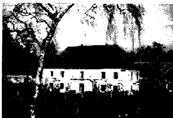
Fig. 1: The late so called Prince Mining Office at Lukavice. Behind it used to be the Lukavice chemical factory and close to it pyrite mines. The situation from the 1950's.

A history of pyrite mining at Lukavice ended in 1892. The mines were closed due to economic reasons - exploitation of pyrite was more expensive than the import of pyrite from abroad (mainly from the Smolnik deposit in North Hungary - presently known as Slovakia). The Lukavice chemical plant still existed for several years but was moved to the nearby town of Slatiřany, closer to the railway. In spite of the fact that the chemical industry definitely finished there during the 1950's, it can probably be assumed that the present major chemical industry near Pardubice in East Bohemia is heritage of the old Lukavice and Slatiřany chemical factories.