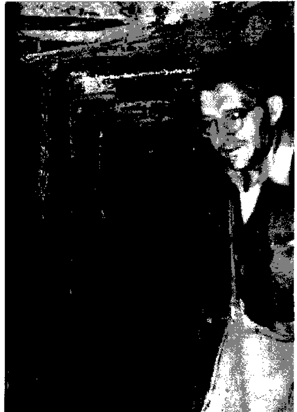
Fig. 5: Old mining gallery at Lukavice reopened in the fifties.

We can summarize that the historical approach to rehabilitation of mining damage at the Lukavice pyrite deposit was very diligently and carefully carried out at this time, and differed widely from the geological exploration and experimental mining of the Lukavice pyrite on the above mentioned site during the 1950's, when no rehabilitation or reclamation were done there (Fig. 5).