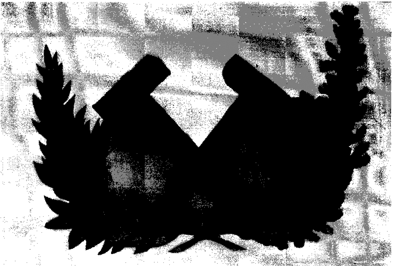
Fig. 9: A mining emblem from the former Lukavice Mining Office.

WOAT, Th.: Umriß der Entstehungs- und Entwicklungsgeschichte der fürstl. Auerspergschen Mineralwerkes zu Groß-Lukawitz in Böhmen. Groß Lukawitz, 1875.