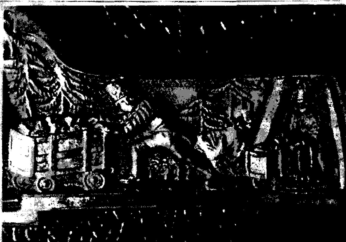
Fig. 8: Figures of miners decorating a hand-grip of a mining foreman stick from Lukavice.