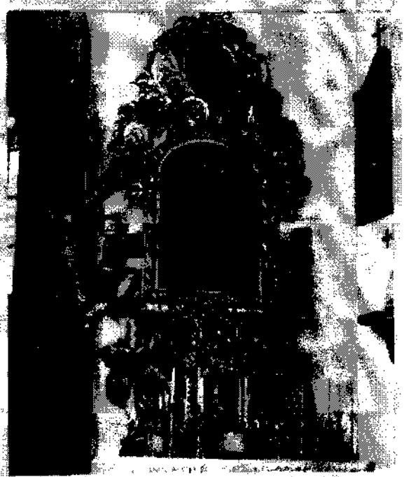
Fig. 7: A baroque altar in the church of Saint Bartolomeus at the village of Bitovany near Lukavice decorated with two statues of miners.