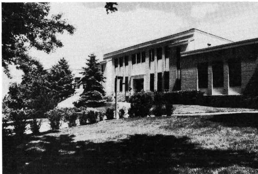
Fig. 2: The Arthur Lakes Library, Colorado School of Mines, Golden, Colorado, USA