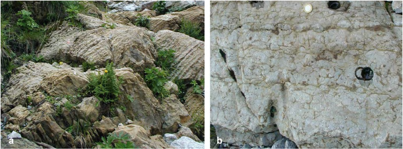
Views of the Uqua Formation at the Cellon Section.