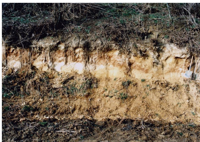
Text-Fig. 3. Outcrop in a vineyard NNW of Hadres with soil-complex PK X; Middle/Lower Pleistocene. Spade for scale.