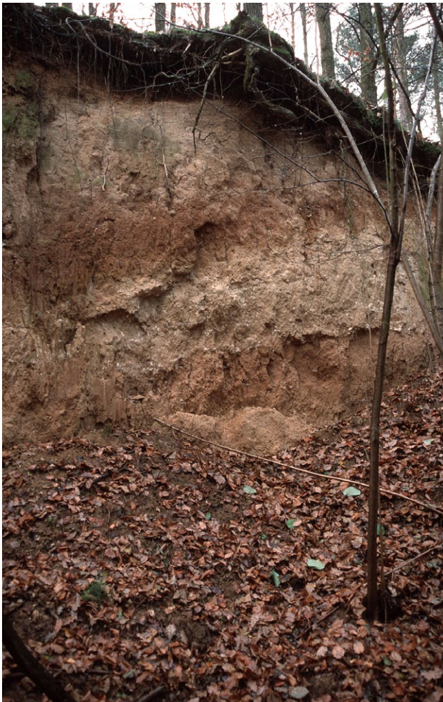
Text-Fig. 5. Outcrop in the Trausnitz valley in the NP Podyjí. Two fossil soils of braunlehm-type (minimum soil-complex PK VII) in loess.