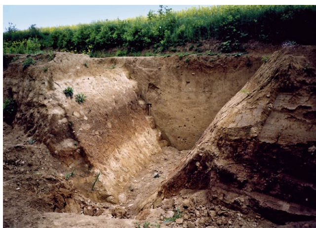
Text-Fig. 4. Outcrop in the NP Podyjí east of Mašovice. Three soil-complexes with five fossil soils (PK IV–VII) in loess, exposed in an excavated Neolithic trench. Hammer in centre of photo for scale.