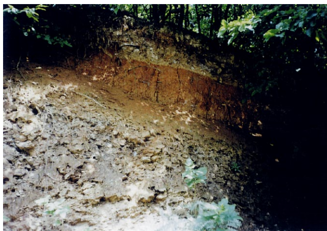
Text-Fig. 2. Track-cut in the NP Podyjí between Podmolí and Lukov. Rotlehm (soil-complex PK X; Middle / Lower Pleistocene) developed on weathered mica schist.

In the brickyard Wienerberger in Göllersdorf at the bottom a brown earthficated luvizem (soil-complex PK VI) is preserved in the profile. After a long hiatus it is overburden by a PK II chernozem.