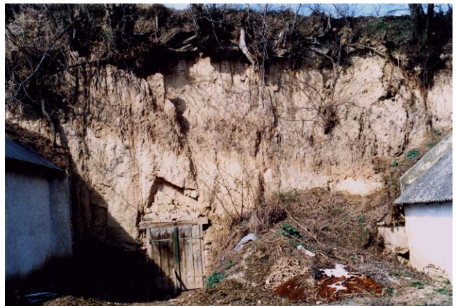
Text-Fig. 7. Outcrop in the western cellar lane in Mailberg with two fossil soils (PK II and III) in loess.

Further, two fossil soils of PK V and one of soil-complex PK VI (Holstein) – a braunlehm-like parabraunerde – are preserved south and north of Alberndorf (Text-Fig. 6) (HAVLÍČEK et al., 1998a).