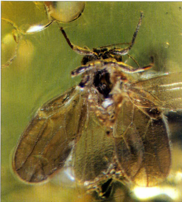
Fig. 4. Total body Protoscena baltica gen. et sp. n. in ventral aspect. NHMWien 1996z0188/0001.