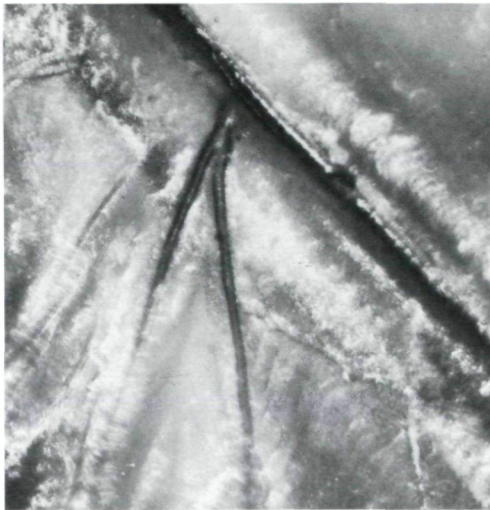
Fig. 2: Common stem of the cubital veins in Mindarus paratransparens n. sp.

Body 2.15 mm long. Head width across the eyes about 0.75 mm. Compound eyes large. Triommatidion present but poorly visible. Ocelli not discernible. Antennae 6-segmented. Total length of the antenna 0.90 mm, the other antenna and secondary rhinaria invisible. Antennal segment lengths in mm: III – 0.34; IV – 0.12; V – 0.12; VI – 0.17 (0.11 + 0.06). Rostrum reaching slightly beyond hind coxae, 1.39 mm in total length. Forewing: length 3.28 mm, width 1.1 mm (Fig. 1).