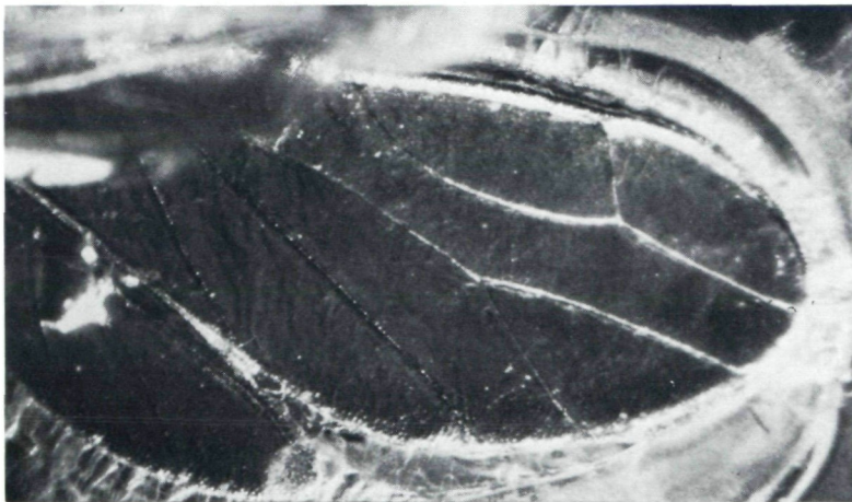
Fig. 3: The forewing of Mindarus magnus with an additional vein between pterostigma and radial sector.

Body length 2.10 mm. Frons slightly protruding. Compound eye strongly protruding with a distally located triommatidion. Antennae 6-segmented, 0.9 mm long with 12 secondary rhinaria; secondary rhinaria transversely oval in shape and located along the entire length of antennal segment III. Lengths of antennal