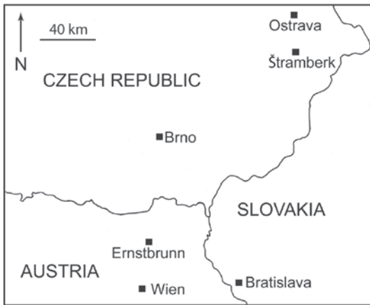
Fig. 1. A schematic view of the study area.

made available are the oldest known members of the Munididae. Both the excellent preservation of these specimens and their unique characteristics present an opportunity to improve our understanding of the early history of the munidid lineage.