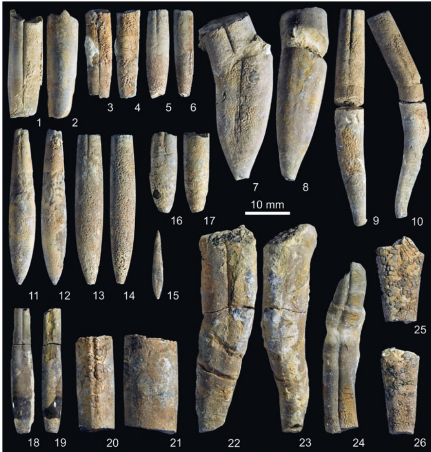
Fig. 2. “Mid”-Barremian belemnites from Serre de Bleyton; depicted are ventral (alveolar side; except for Duvalia , here it is the dorsal one) and lateral sides (scale bar graduates 1 cm).