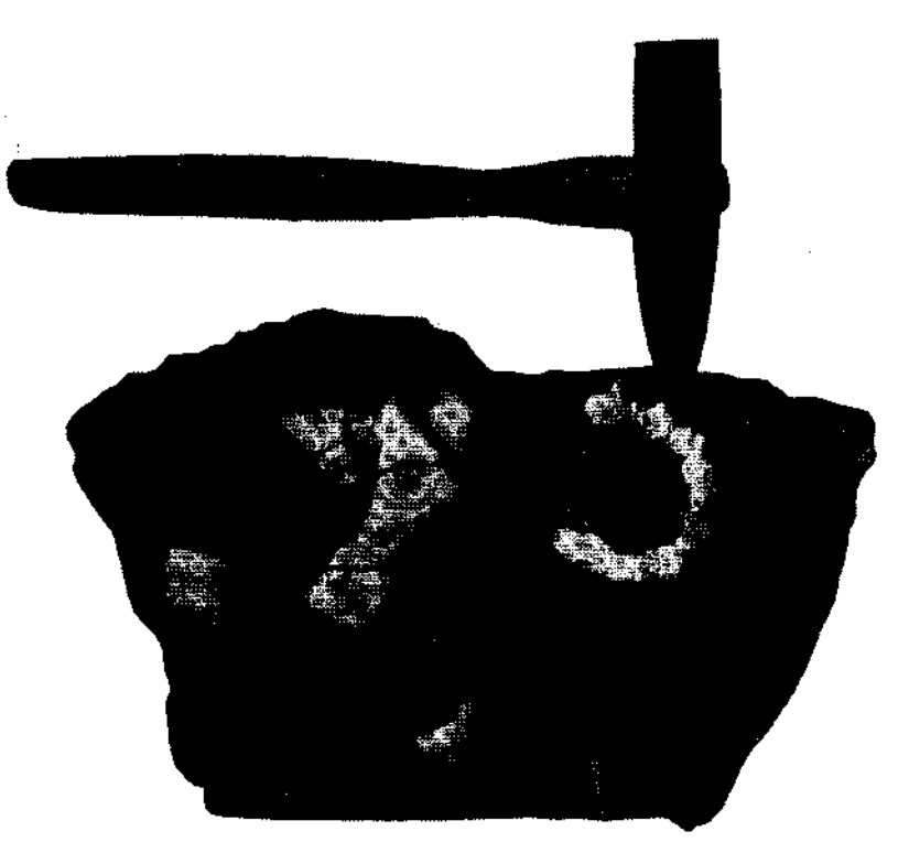
Fig. 2. Lawsonite porphyroblasts in chloritic glaucophane schist from the Franciscan of California ( \times 1).