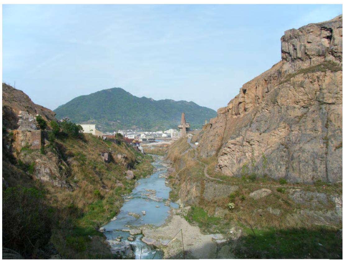
Fig. 1: The Wenzhou mining location, Alum Mine Heritage, southern Zhejiang Province, East China

Wenzhou Alum Mine is a typical nonmetallic mine of the traditional mining industry in China, which is urgently to be conserved and utilized as a mining heritage property for sustaining development of local society, economy and culture. Basing on analyzing geographical environment, historical vicissitude and components of heritage, there are three characteristics of the Alum Mine (Fig. 1 & 2)