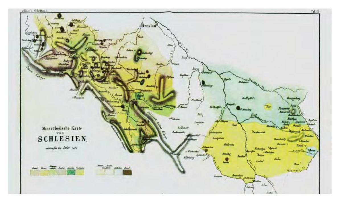
Fig. 3: Leopold von Buch. / 1802. Mineralogic map of Silesia, designed in 1797. / Mineralogische Karte von Schlesien, entworfen im Jahre 1797.