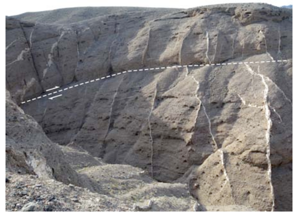
Fig. 1. Calcite veins in fanglomerate of the Pliocene Funeral Formation in Furnace Creek wash, Death Valley, California, USA, offset by a low-angle fault.

First results from the southern Great Basin were reported by Winograd et al. (1985), who determined \delta D values of inclusion water in Plio-Pleistocene calcite veins (fossil spring feeders) emplaced in clastic deposits of the Amargosa Desert and Furnace Creek (Death Valley), Late Pleistocene phreatic deposits from Devils Hole cave in Ash Meadows, and Holocene flowstone from Trout Springs cave in the Spring Mountains. The authors reported a unidirectional decline of \delta D from values between -50 and -70 ‰ to values ranging from -85 to -105 ‰ between the