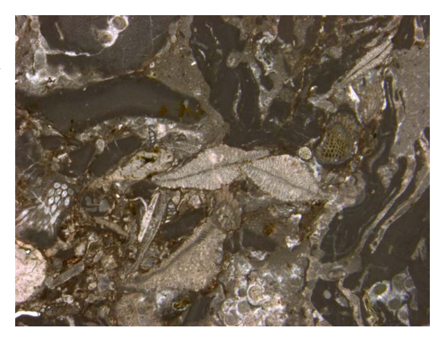
Figure A1.23 ▲ Image of a thin section of rhodolithic limestone with Discocyclina sp. (Fackelgraben member)

The Fackelgraben Member and the overlying Frauengrube Member are separated by an irregular erosional surface (Rasser and Piller, 1999), that has been described previously from other outcrops in the Salzburg area (Vogeltanz, 1977). Clasts of the Fackelgraben Member are reworked in the basal part of the Frauengrube Member (Rasser and Piller, 2001), which comprises 0.5 m of brownish sandstone with a marly matrix, that contains poorly preserved calcareous