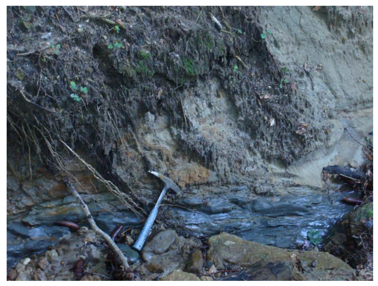
Figure A1.25 ▲ Sharp contact between claystone and sand at the St. Pankraz section

Directly to the south of the St. Pankraz carpark, 8 m thick succession of grey claystone and marly claystone is exposed along a hiking trail. No macrofossils or indicators of bioturbation were observed in the claystone that consists of kaolinite (47 wt%), smectite (39 wt%) and illite (14 wt%). The claystone-rich succession is the tectonically truncated base of a small tectonic thrust unit of the south-Helvetic nappe complex. A higher part of this south-dipping succession outcrops ca. 20 m southward, in the course of a small creek. There, thick poorly sorted coarse-grained sandstone beds are alternating with the claystone. Most of the white to yellowish coloured sandstone beds show poor grain sorting. Occasionally parallel lamination occurs. The sandstone beds have sharp contacts to the pelitic rocks and often display ripup clasts (up to 20 cm in diameter) indicating high energy erosive events. The claystone-sandstone-succession is overlain by a few meters of very pure quartz sandstone overlain by calcareous arenites