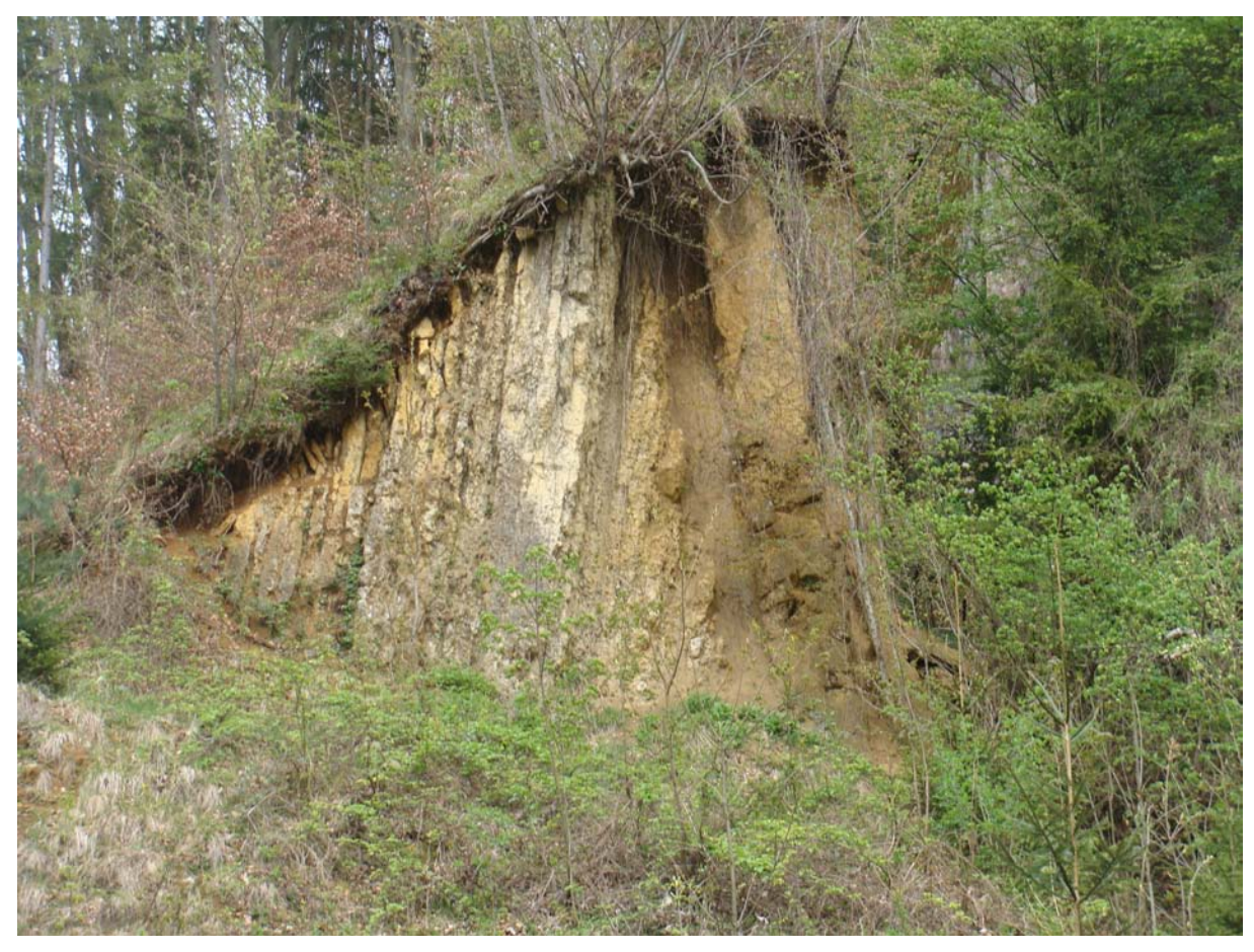
Figure A1.24 ▲ Photograph of the type locality of the Frauengrube Member (Note the erosional unconformity between the Fackelgraben Member (left) and the Frauengrube Member (right))

known about its stratigraphical distribution elsewhere. The several specimens of Glaphyrocysta (cf.) semitecta are very close to, but perhaps not identical with Glaphyrocysta semitecta , a taxon previously recorded from NP15 to near the Eocene/Oligocene boundary in NW Europe (e.g. Bujak et al. 1980; Heilmann-Clausen and Van Simaeys 2005). Nothing else in the samples suggests such a young age. The abundance of Apectodinium points to an age no younger than the Ypresian-Lutetian transition, most likely early Ypresian or older. The two specimens of Deflandrea oebisfeldensis also point to an early Ypresian or older age, as this form becomes extinct in the lower Ypresian in NW Europe (probably in or near top of NP11, e.g. Heilmann-Clausen and Costa 1989; Luterbacher et al. 2004).