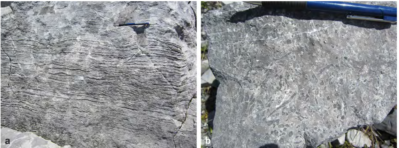
Views of the Polinik Formation in the field. a) laminated limestone (photo A. MÖRTL); b) rock surface with tabulate corals (photo A. MÖRTL).